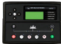
DSE 7420 Remote Control Panel